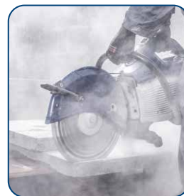
WITHOUT DURO DUST SUPPRESSION