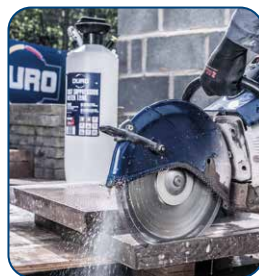
WITH DURO DUST SUPPRESSION

IDEAL FOR COMPANIES WHO WOULD GAIN FROM DURABILITY