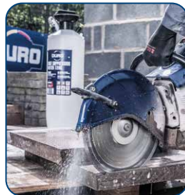
WITH DURO DUST SUPPRESSION

IDEAL FOR CONTRACTORS WHO NEED A MORE PORTABLE TANK