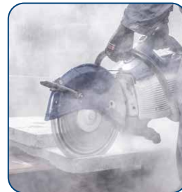
WITHOUT DURO DUST SUPPRESSION