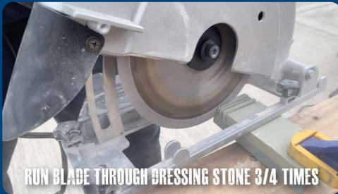
RUN BLADE THROUGH DRESSING STONE 3/4 TIMES