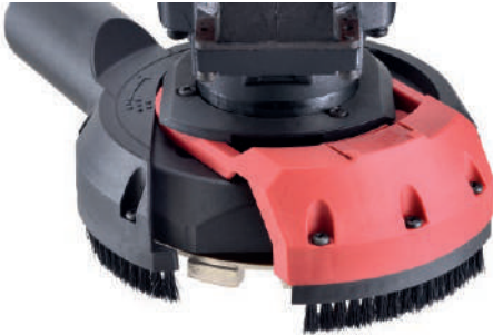
Sliding Cover For Edge Grinding - Tool Free