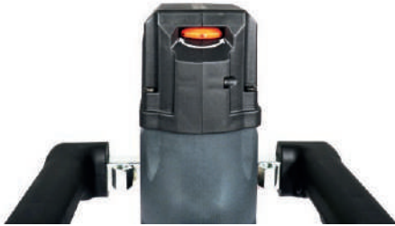
Variable Speed Adjustment