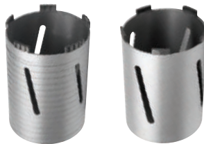
STANDARD DDC 38 - 202 mm

All light to medium brick and block types