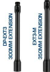
DP-EXT3 300MM EXTENSION