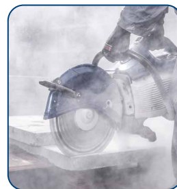
WITHOUT DURO DUST SUPPRESSION