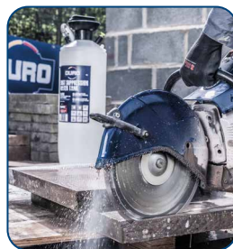
WITH DURO DUST SUPPRESSION

PACKED WITH STABILITY FEATURES IDEAL FOR THE JOB SITE